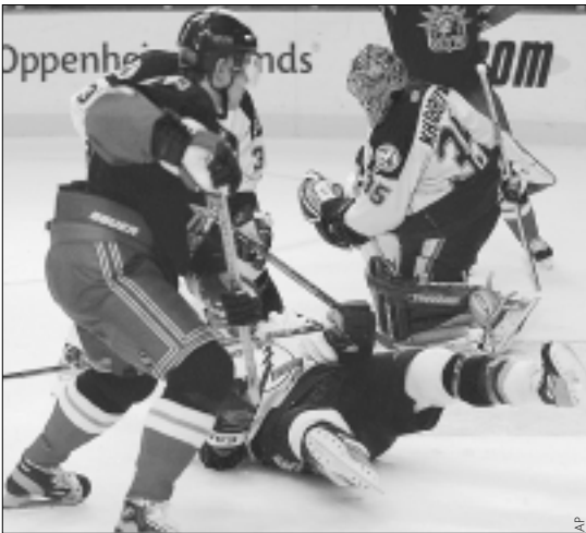
NEW YORK Rangers Pavel Bure (left) puts the puck past Tampa Bay Lightning goalie Nikolai Khabibulin and Dan Boyle during the second period Sunday.