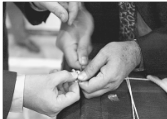
IRAQI officials seal a suitcase containing reports on the country's nuclear, biological and chemical activities before sending it to New York and Vienna.