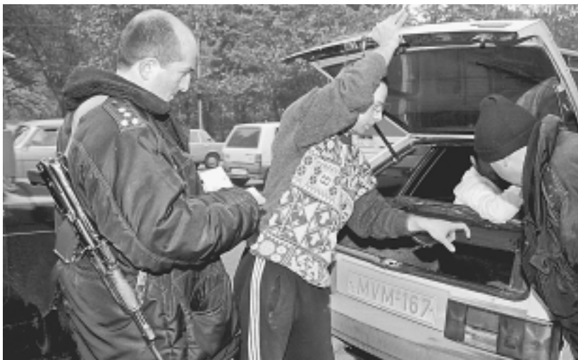
A GEORGIAN police officer stops a car and checks the occupants' documents during an anti-crime operation in Tbilisi on Saturday. Georgian police flooded the streets of the city in an operation that resulted in dozens of arrests.