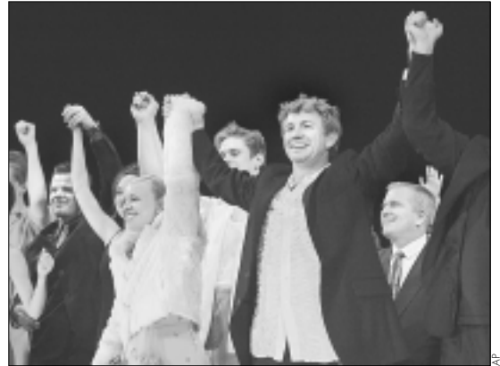
DIRECTOR BAZ Luhrmann and his designer wife Catherine Martin (center) in the director call after the Broadway debut of his production of 'La Boheme.'

NEW YORK — Sandra Bullock in a slinky black evening gown, edging past paparazzi. A throng of onlookers waiting in vain for the arrival of Leonardo DiCaprio (he sneaked in through a side entrance). Candice Bergen holding court with friends and fans in the lobby. It wasn't a typical night at the opera. But this wasn't just any opera: It was Baz Luhrmann's production of "La Boheme," the Puccini classic about young artists living and loving in the garrets above Paris.