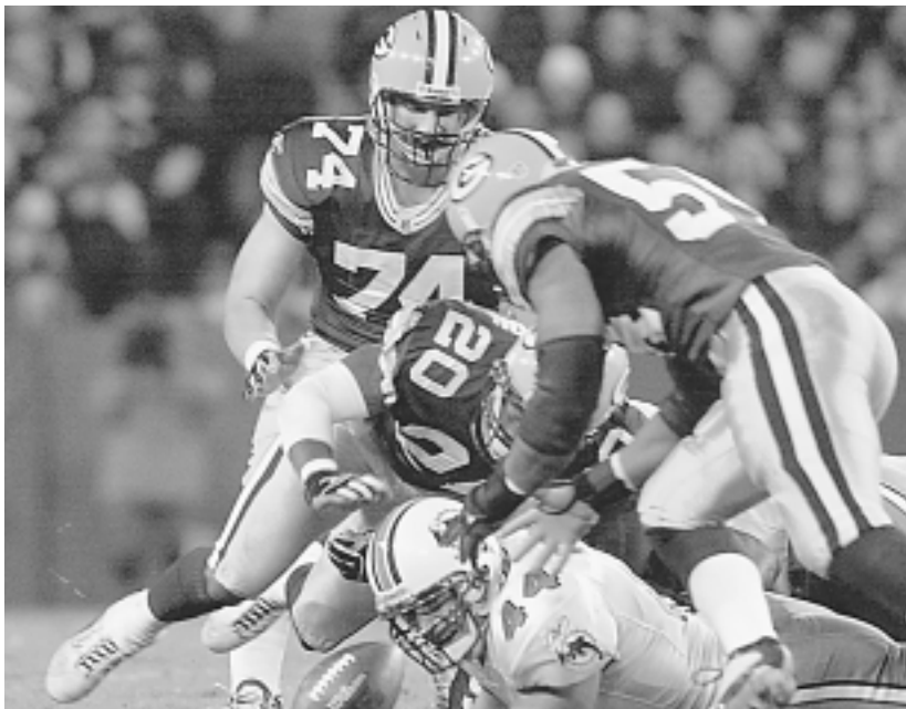
MIAMI DOLPHINS fullback Rob Konrad (44) fumbles the ball in front of Green Bay Packers' Aaron Kampman (74), Marques Anderson (20) and Nate Wayne (54) in the first quarter Monday. The Packers recovered the fumble.

tonight," coach Mike Sherman said. "You have to ask me at the end of the season if it's a special season. We still have a lot of games