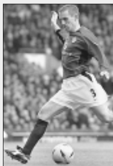
PHIL NEVILLE scores in Man United's win over West Ham.